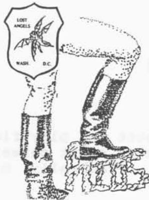
LOST ANGELS PHILATELIC UNIT CACHET NO. 1