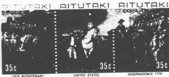
Surrender of Cornwallis