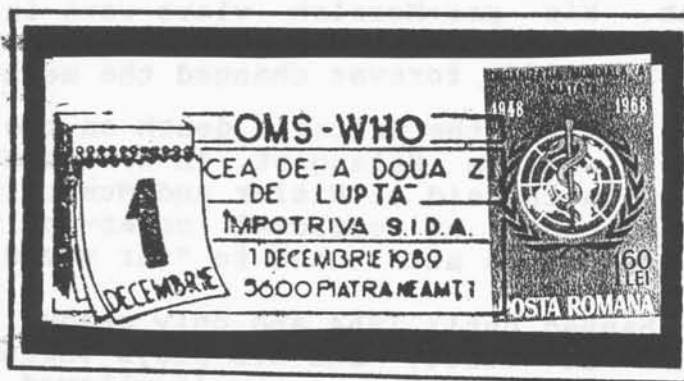
a Romanian postal cancellation