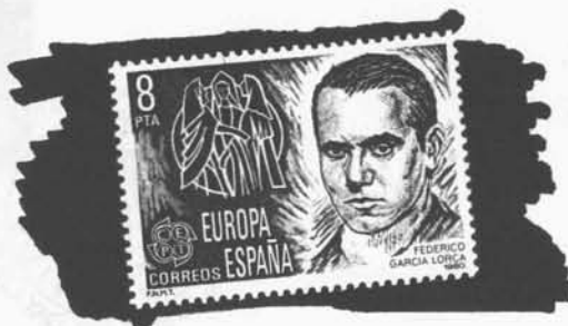
Scott No. 2208-09

by Thomas Krolak * the empty closet 6/89